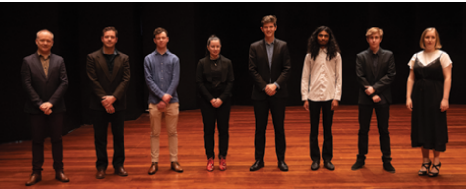
2020 Composition Project Composers.