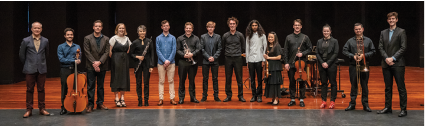
2020 Composition Project composers with the WASO musicians they worked with for the project.