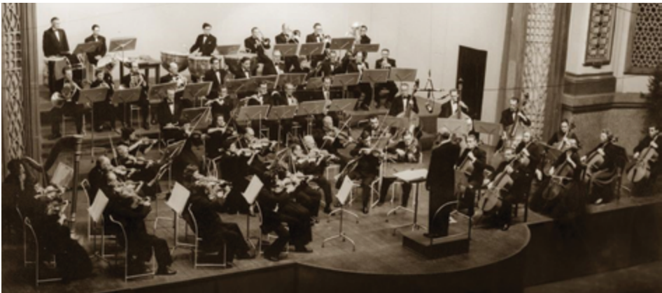
WASO performing at Capitol Theatre in 1958.

If you have anything you think we may be able to use or if you have any questions, we can be contacted by email on wasoarchive@waso.com.au . We look forward to hearing from you.”