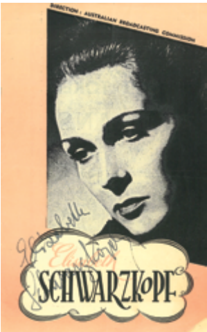
Signed program from Elisabeth Schwarzkopf. concert, a diary entry or letter describing a concert experience, an anecdote about a particular concert, an interesting photo, or perhaps a concert program we’re missing from our collection.

We’d love to hear from you if you have anything interesting to contribute to the WASO Archive Project. It may be a memory about your first WASO