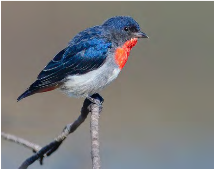
Missletoe Bird (Perched)