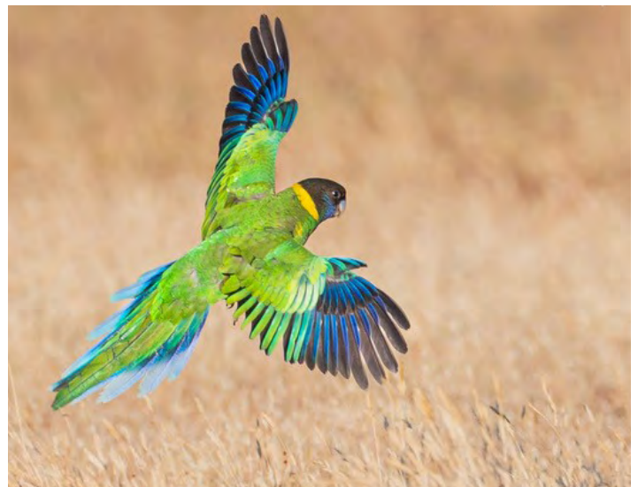
Australian Ringneck Parrot

The move to Perth in late 2015 gave Laurence a new challenge due to the contrast between European and Australian wildlife, "I had to start to learn a whole new flock, as it were. The good light and weather here also reawakened my love of photography, which had lapsed somewhat over the previous years and since that time, I have been enjoying the many wonderful spots you can see birdlife in and around the city."