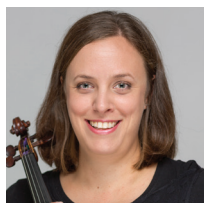
Bec Gloire Violin

Q: What is your favourite thing about being in EChO?