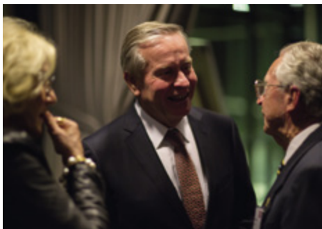
Chairman Janet Holmes à Court AC with The Hon Colin Barnett MLA and Patron Peter Stokes