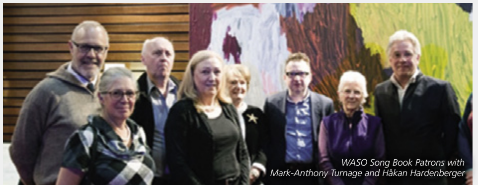
WASO Song Book Patrons with Mark-Anthony Turnage and Håkan Hardenberger

WASO will be commissioning a new Oboe Concerto by Judith Weir, current Master of the Queen's Music. This will be a co-commission between the Adelaide Symphony Orchestra, the Tasmanian Symphony Orchestra, the Britten Sinfonia and WASO. After its world premiere in Adelaide in 2018, this new work is scheduled to be premiered with WASO later in 2018 or 2019, WASO's 90th anniversary year. The Principal Oboe of each Orchestra will perform the Concerto.